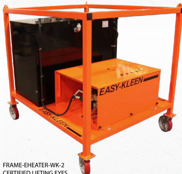
FRAME-EHEATER-WK-2 CERTIFIED LIFTING EYES

Also available: Stainless Steel frames which are ideal for corrosive or sanitary environments such as food and fish plants, salt water off shore operations, mills and mining, as well as outdoor applications.