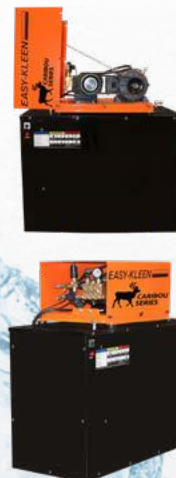
EH430E472A-460 Double Coil Larger Heating Capacity