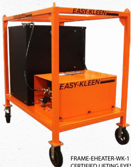
FRAME-EHEATER-WK-1 CERTIFIED LIFTING EYES